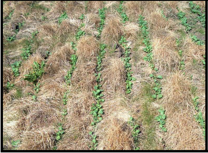
Above: The canola plant population was very satisfactory, however the lack of rain during the growing season limited yields.

Above: On the LHS one of the strips that did not receive a pre-seeding burnoff herbicide application on June 10<sup>th</sup> when the first incrop herbicide application was made. There is considerably more green fescue growth on this side compared to the RHS which received a pre-seeding herbicide application.